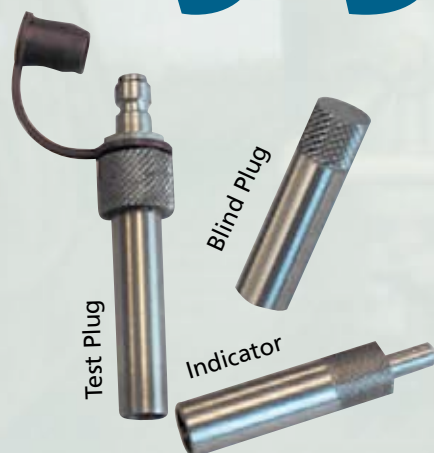
Test and surveillance units

The KaMOS® Test plug is to be used for the pressure test when RTJ/ gaskets are installed and will be replaced by either indicator for future leakage surveillance or blind plug cap.